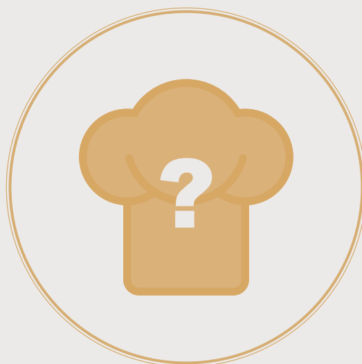
廚師推介 +$38 Chef's Recommendation