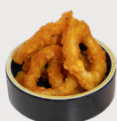
唐揚魷魚圈 · 辣香料蛋黃醬 +$38 Karaage Squid Ring · Cajun Mayonnaise