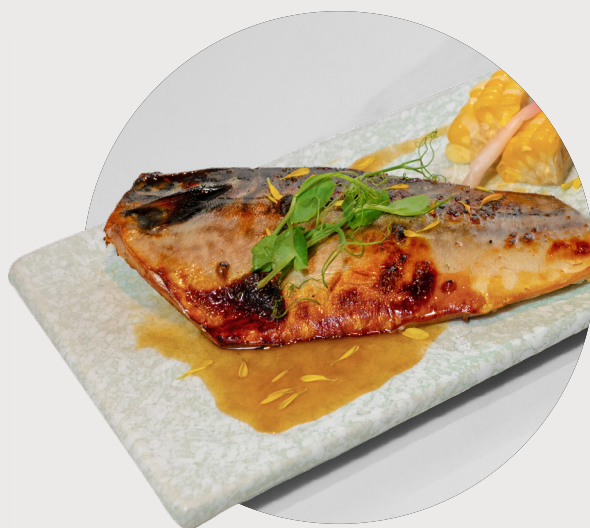
鯖魚西京燒 · 菠蘿照燒汁 Saikyo Yaki Mackerel · Pineapple Teriyaki Sauce