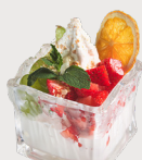
北海道 8.0 牛乳軟雪糕 +$48 Hokkaido 8.0 Milk Soft Ice-cream 阿華田脆脆 / 士多啤梨醬雙色鮮果 / 現創雙重朱古力 / 岩鹽芝士花生醬 Ovaltine / Double Fruit / Double Chocolate / Salted Cheese · Peanut Butter