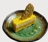
是日精選蛋糕 +$38 Daily Cake