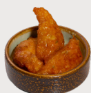
雞皮餃子 · 菠蘿照燒汁 +$28 Chicken Skin Dumplings · Pineapple Teriyaki Sauce