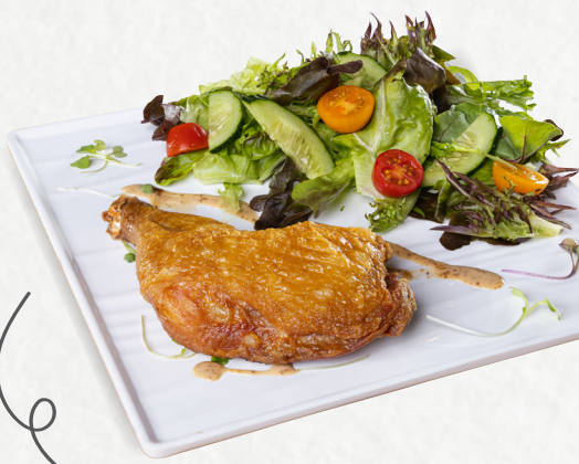
脆炸雞腩 + 水耕菜沙律 Deep-fried Chicken Thigh + Hydroponic Vegetables Salad