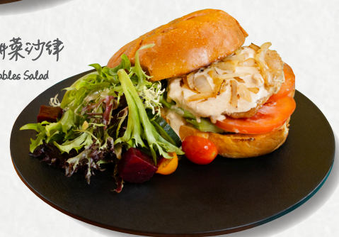
爆脆豬扒包 + 水耕菜沙律 Pork Chop Bun + Hydroponic Vegetables Salad