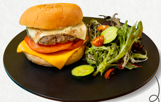
邪惡芝士牛肉漢堡 + 水耕菜沙律 Cheese Beef Burger + Hydroponic Vegetables Salad