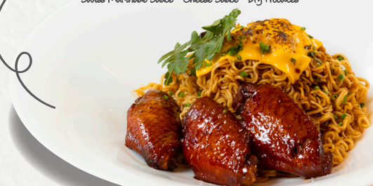
秘製花椒瑞士雞翼 (3隻) + 芝士撈出前一丁 Chicken Wing (3pcs) + Sichuan Peppercorn Oil + Swiss Marinade Sauce + Cheese Sauce + Dry Noodles