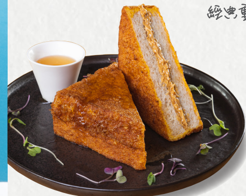
經典重量級粒粒花生醬西多士 Traditional French Toast + Double Peanut Butter + Honey