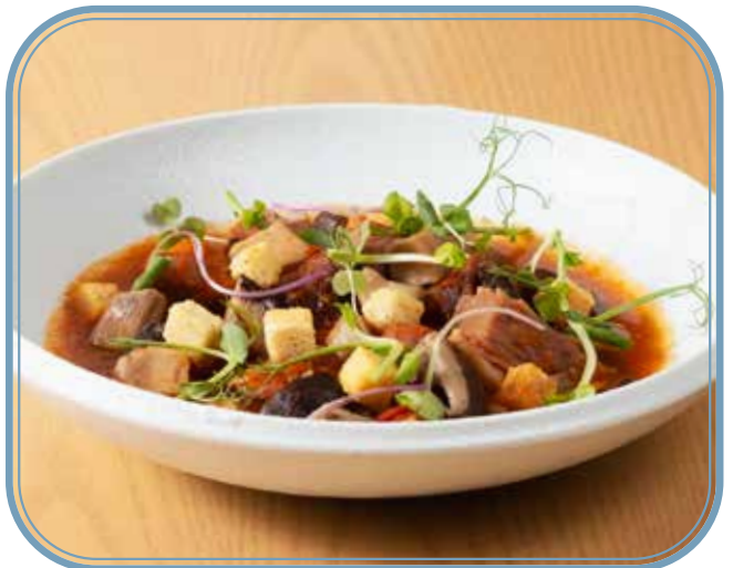
西班牙辣肉腸燴豬梅肉配吐司 Chorizo . Braised Pork Plum . Toast $88