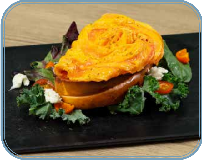
明太子炒蛋吐司 Scrambled Eggs . Mentaiko . Toast $58