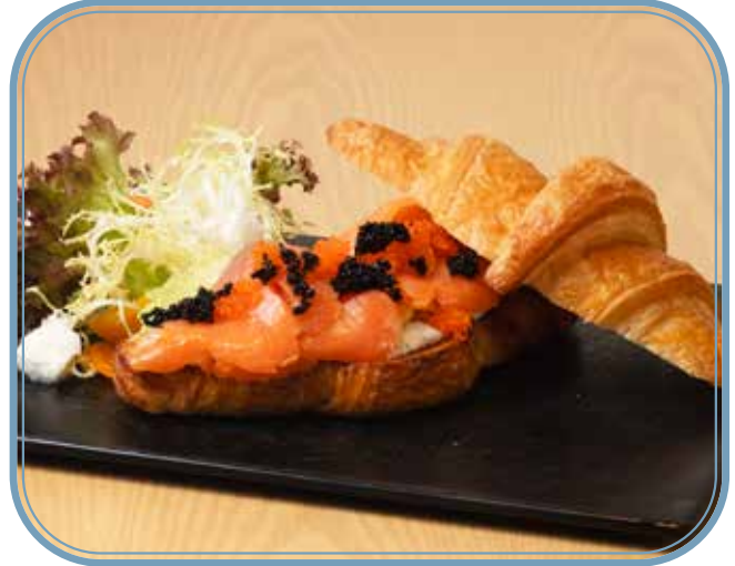
蟹肉煙三文魚牛油果牛角包 Crab . Smoked Salmon . Avocado . Croissant $68