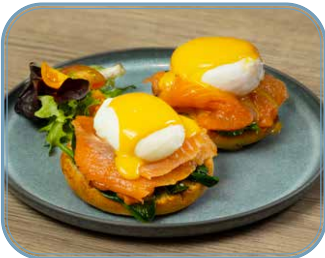
煙三文魚菠菜班尼迪蛋 Smoked Salmon . Spinach . Egg Benedict $78