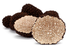
BURGUNDY TRUFFLE 秋季黑松露 Tuber Uncinatum