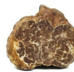
BIANCHETTI TRUFFLE 春季白松露 Tuber Borchii